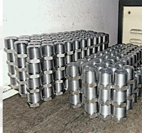
Hex Drain Plugs