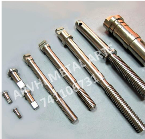
GGC Stem Set