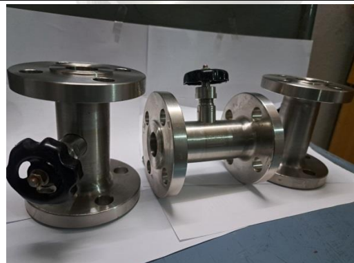
Flanged End Needle Valve