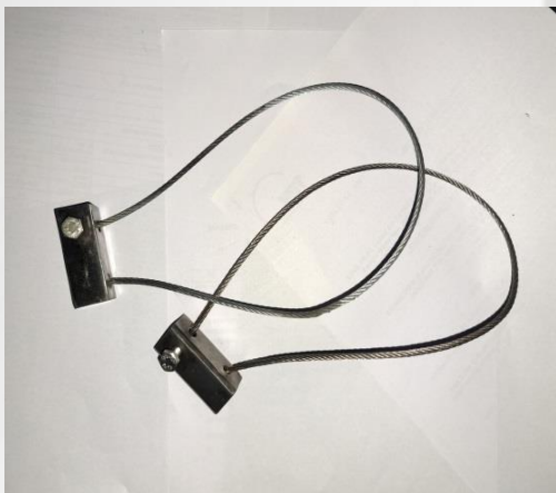
Carseal Lock for Valves