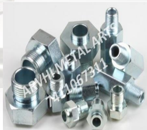
Pipe Fittings & Connectors