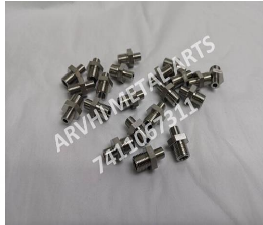
Pipe Fittings & Connectors