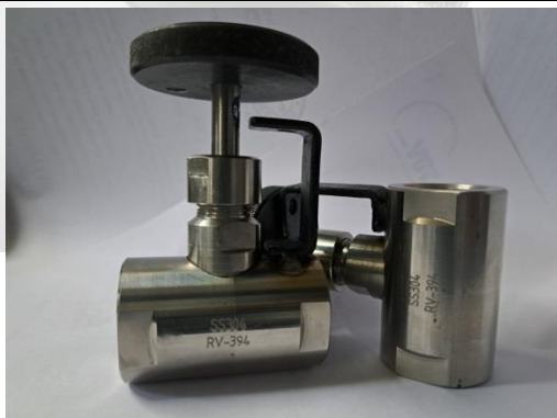
Needle Valve with Locking Arrangement